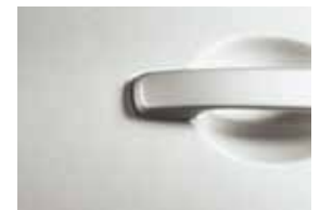
Blade Silver /M KY0