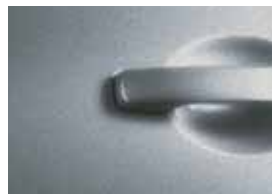
Faded Denim /M B52