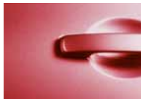
NEW Magnetic Red /M NAJ