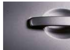
Nightshade /M GAB