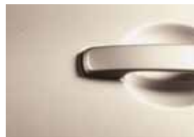
Café Latte /M C30