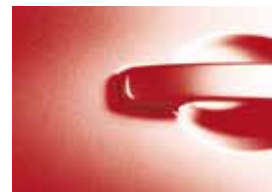
Flame Red /S Z10