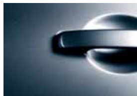
Cayman Blue /M BW9