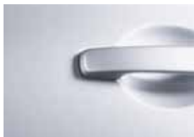
NEW Mineral Grey /M KAQ