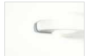
Arctic White /S 326